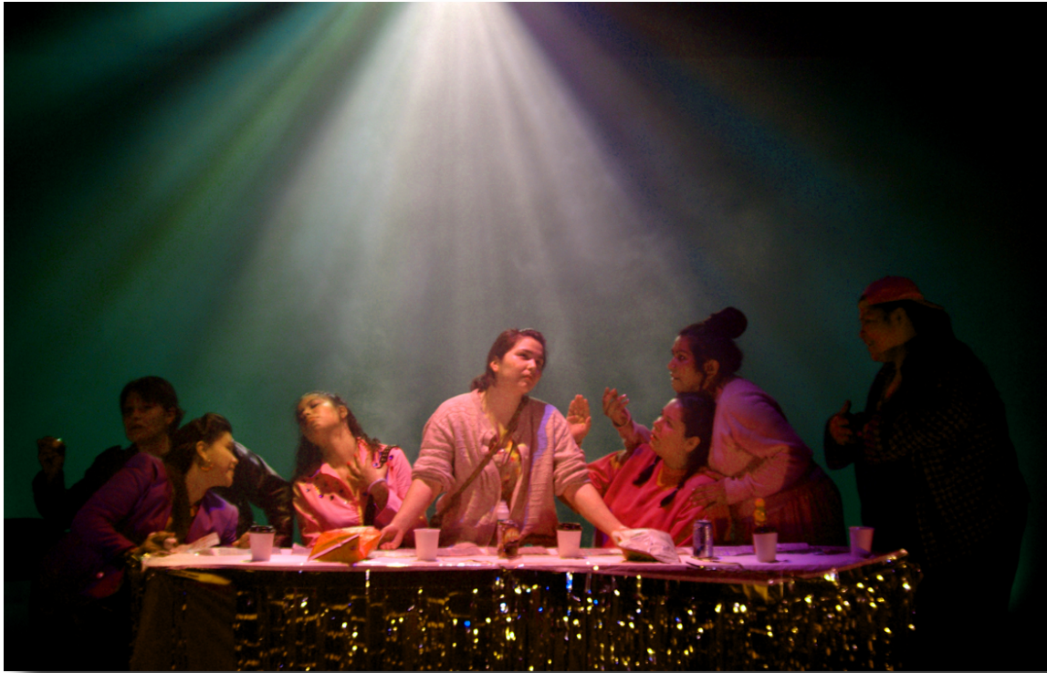
The Rez Sisters by Tomson Highway, Centre for Indigenous Theatre.