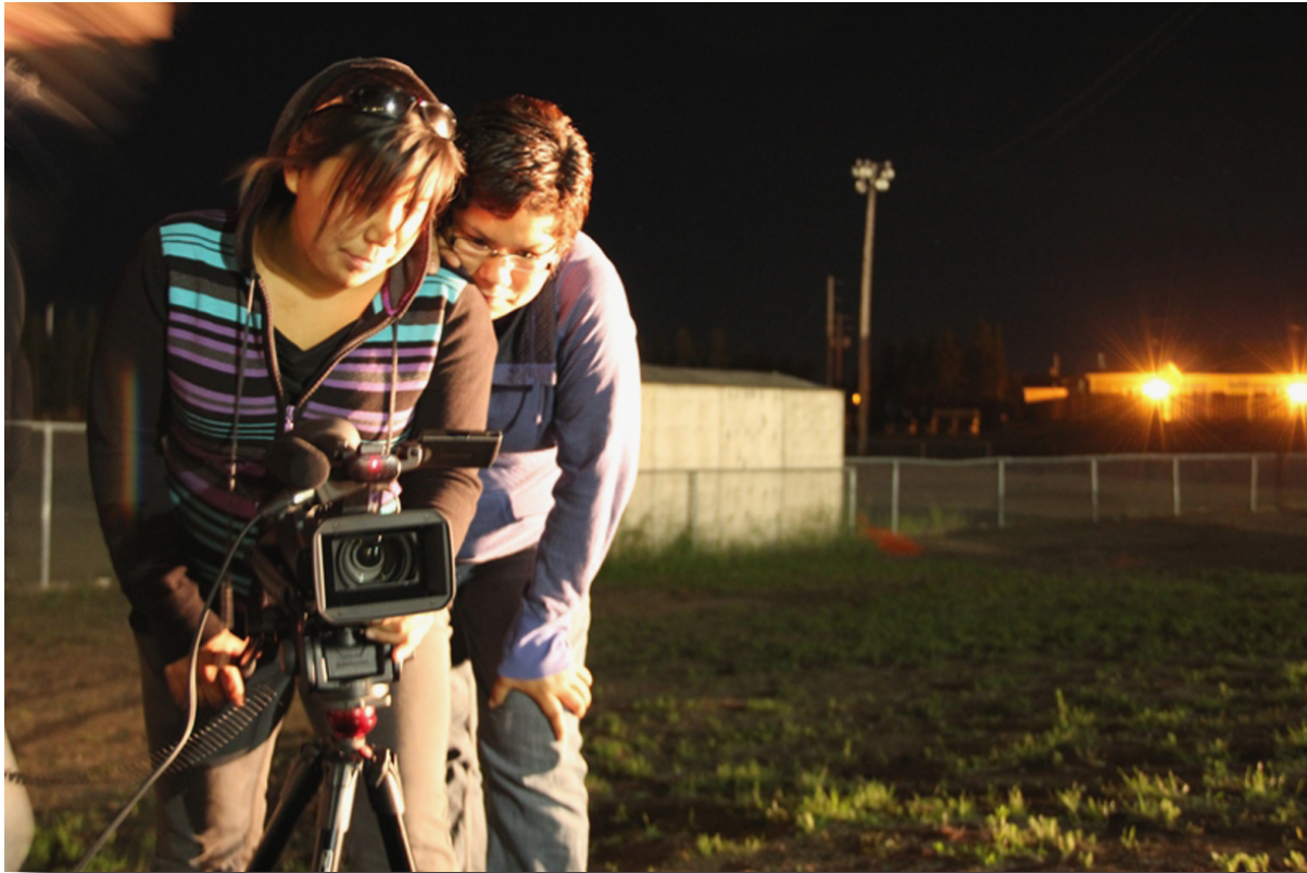
Shooting of Journal d'un Sevrage, Wapikoni mobile.