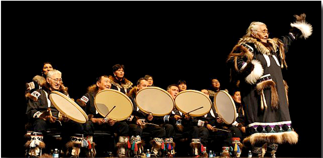
Inuvialuit Drummers and Dancers, Inuvik.

My hope is that the work that so many of our people are engaged in now, to restore some of these practices, to incorporate our knowledge and to recover the knowledge and philosophy and the ethics in a contemporary life way that makes sense and restores the stewardship, restores the community, restores the bonding that we have with our land that has been severed for many years.