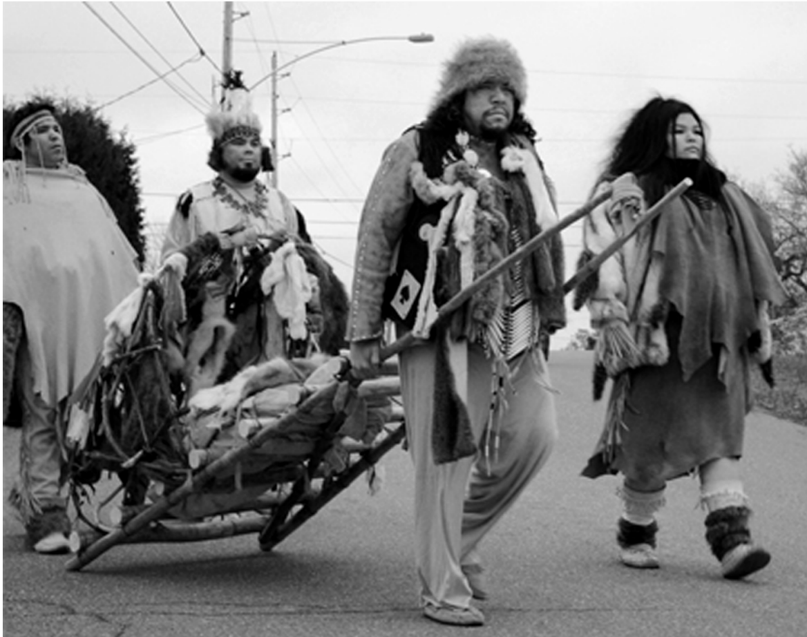
Global Savages by Debajehmujig Theatre.