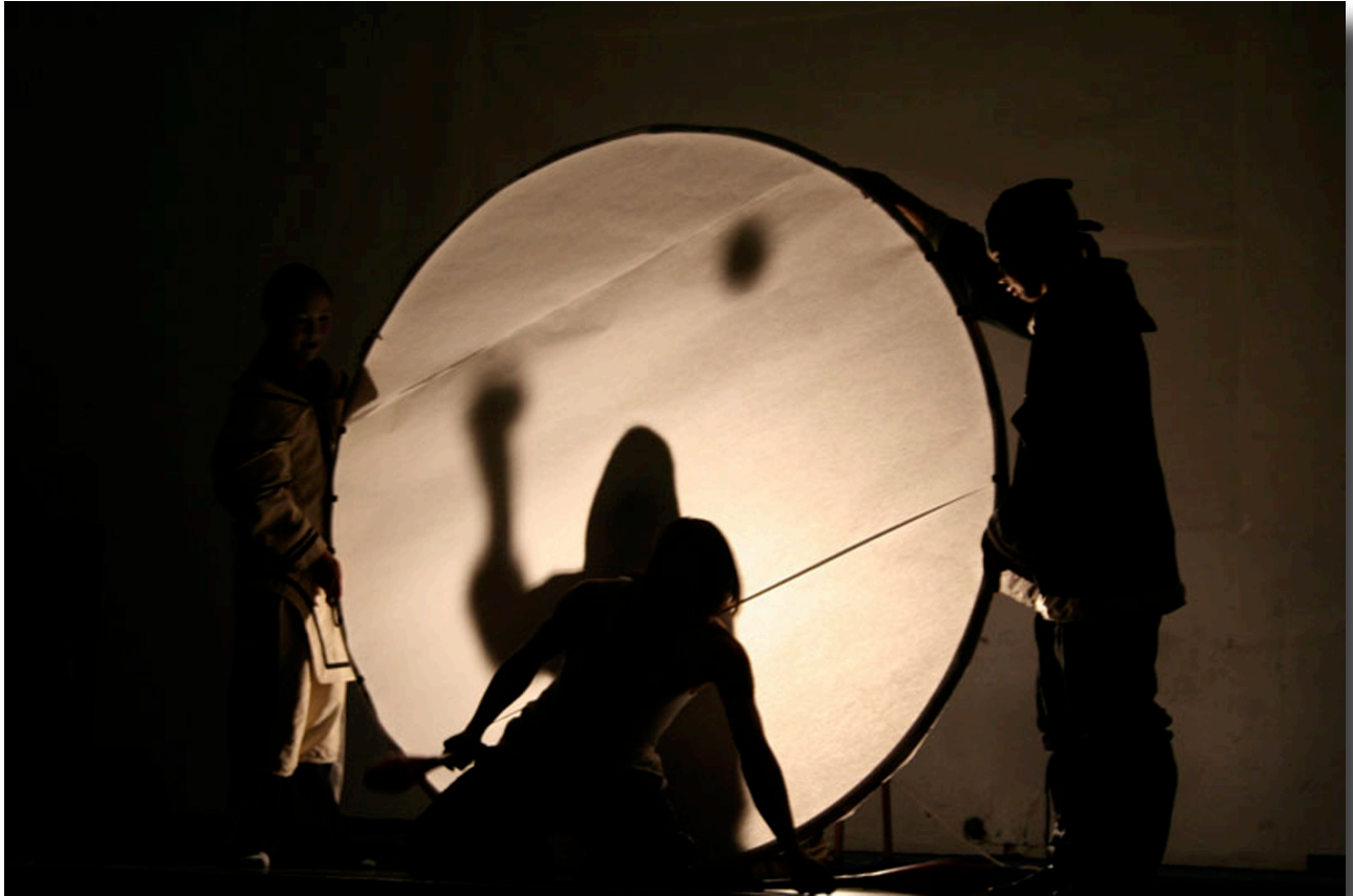
Oaraya by Art Cirq.

The mind is called 'mom tune ay chi kun'. 'Mom tune ay chi kun' is the sacred place inside each one of us where no one else can go. It is in this place that each one of us can dream, fantasize, create and, yes, even talk to the grandfathers and grandmothers. The thoughts and images that come from this place are called 'mom tune ay chi kuna', which means wisdoms, and they can be given to others in stories, songs, dances and art. Stories are called 'achimoon', songs are 'nugamoon', dances are 'neemeetoon' and art is 'tatsinaikewin'. They sound almost the same, don't they? That is because all these words, describe gifts that come from the sacred place inside (Maria Campbell, 1985).